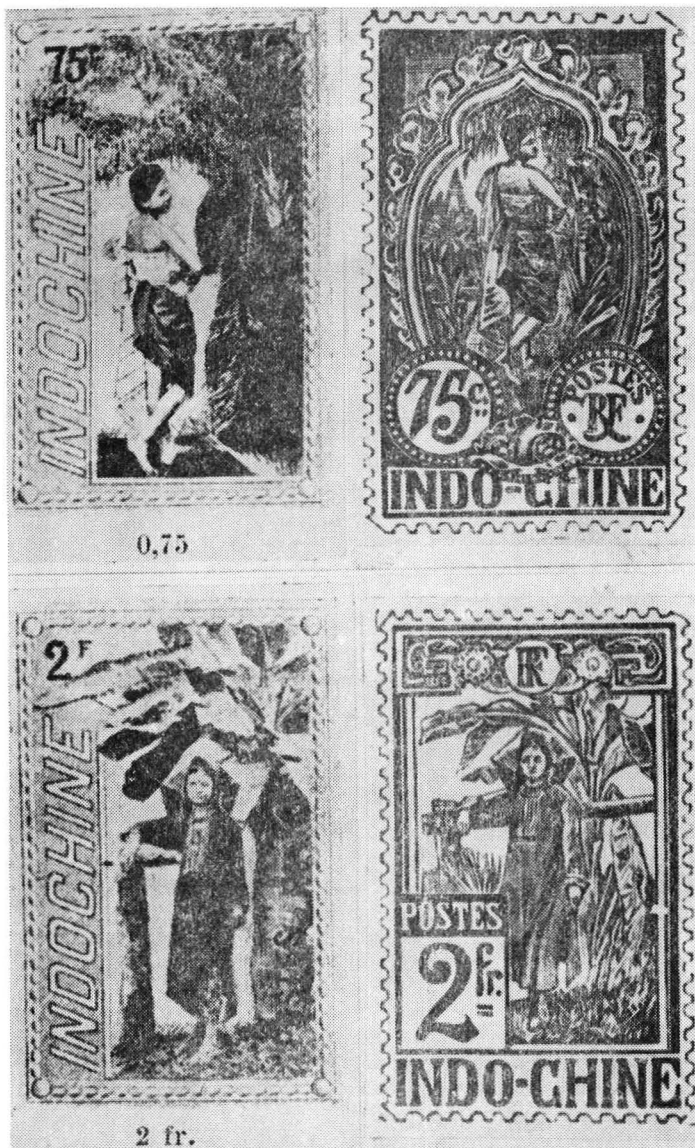
Figure 5a (top), 5b (bottom) essay models at left, stamps at right

The situation is similar with the Muong woman postcard. (Fig. 3). It was published in Indochina by the most prolific postcard producer there, P. Deulefils of Hanoi. The girl on the card is certainly the same one appearing on the 2 francs value. While the photograph captures the entire figure of the woman, more detail is lost in the etching process than was the case with the Anamite girl discussed above. However, the costume and the overall position of the girl are the same on the postcard, essay and the stamp. However, the original that was used in the essay( and consequently in the stamp)