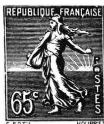
Fig. 1 Hourriez 1935 Sower Essay