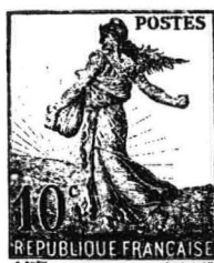
Fig. 4 Mouchon's "Landscape" Essay