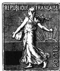
Fig. 2 Master Die of Sower Type