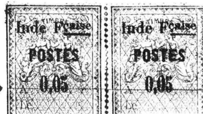
Fig. 3 Fig. 4