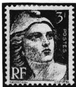
3c Marianne de Gandon