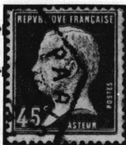
45c Pasteur