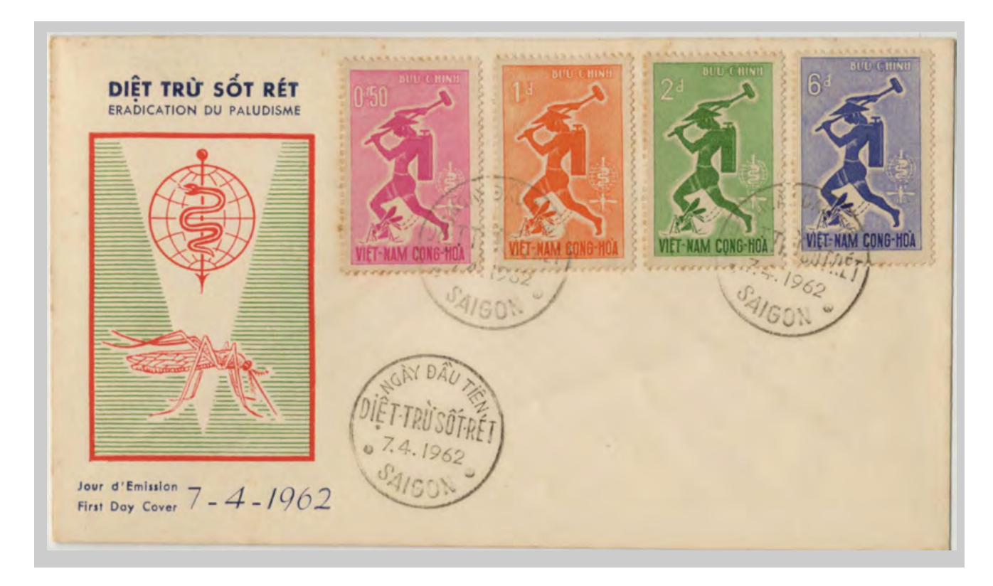
FDC by unknown cachet maker (blue lettering) (type 2 cancellation)