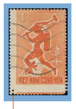
Double perforation. The comb perforator may have been bumped which caused the extra perforations.