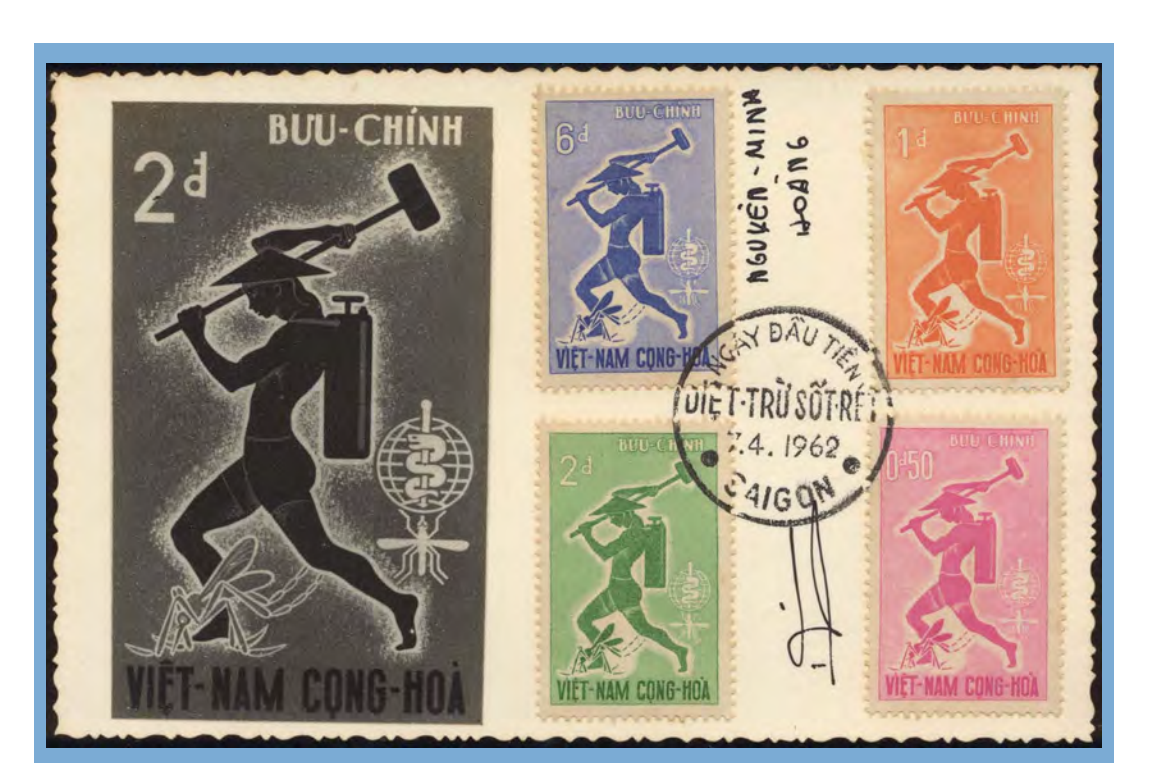
Only recorded maximum card with black/white image of the stamp. (type 4 cancellation). Card has the designer's printed name and signature, Nguyen Minh Hoang.