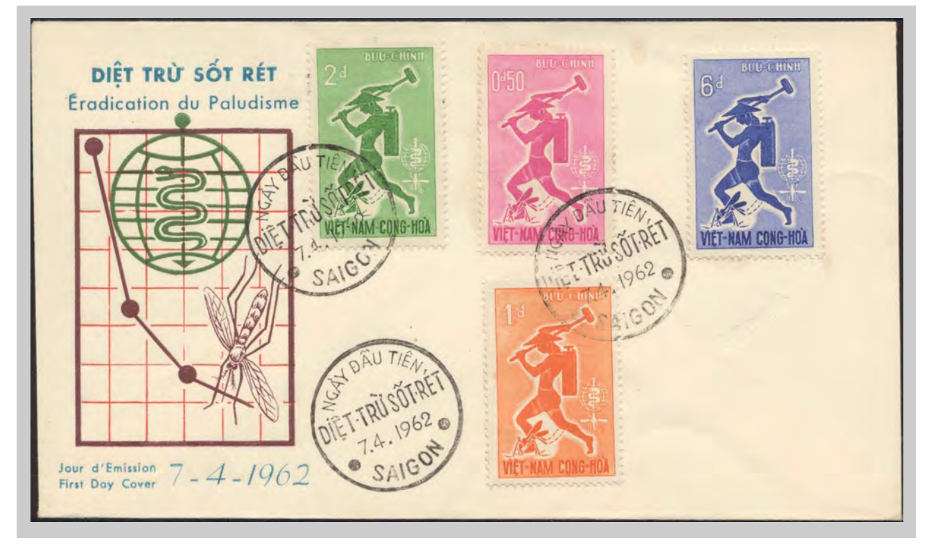
FDC by unknown cachet maker (blue lettering) (type 4 cancellation)