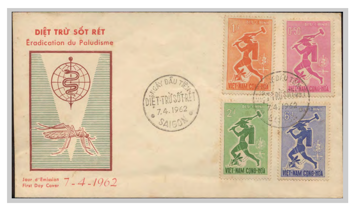
FDC by unknown cachet maker (red lettering) (type 2 cancellation)