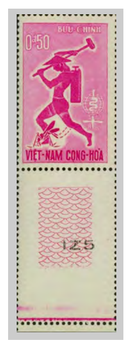
I = Printed in the Imprimerie (Printing Works) Z = Machine Operator Z