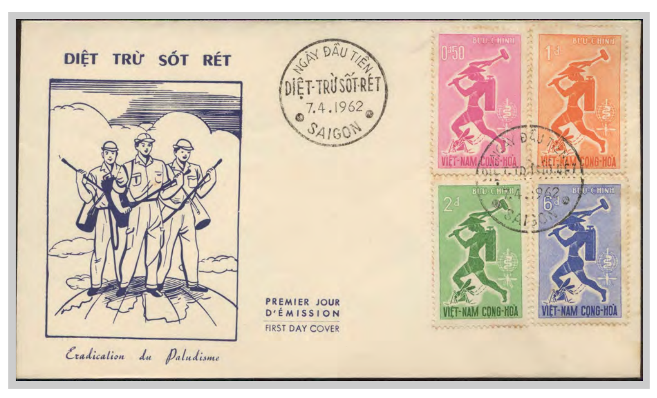
FDC by T.Q.H. (type 3 cancellation)