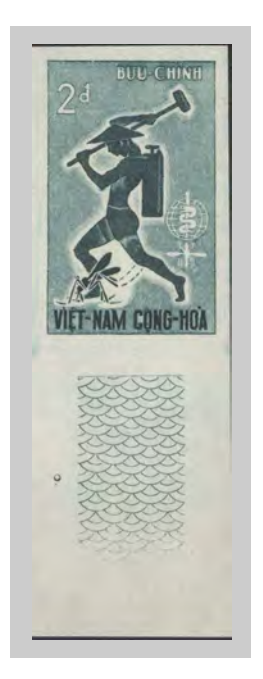
Trial Color Plate Proof. The 2D was the only value produced in this format.

Sepia Die Proof - 2 Dong was the only value produced as a Sepia Die Proof (5 Produced)