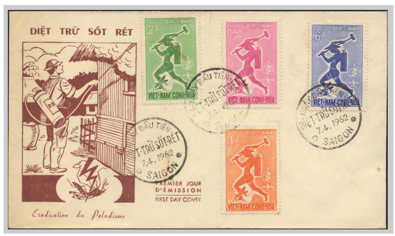
FDC by T.Q.H. (type 4 cancellation)