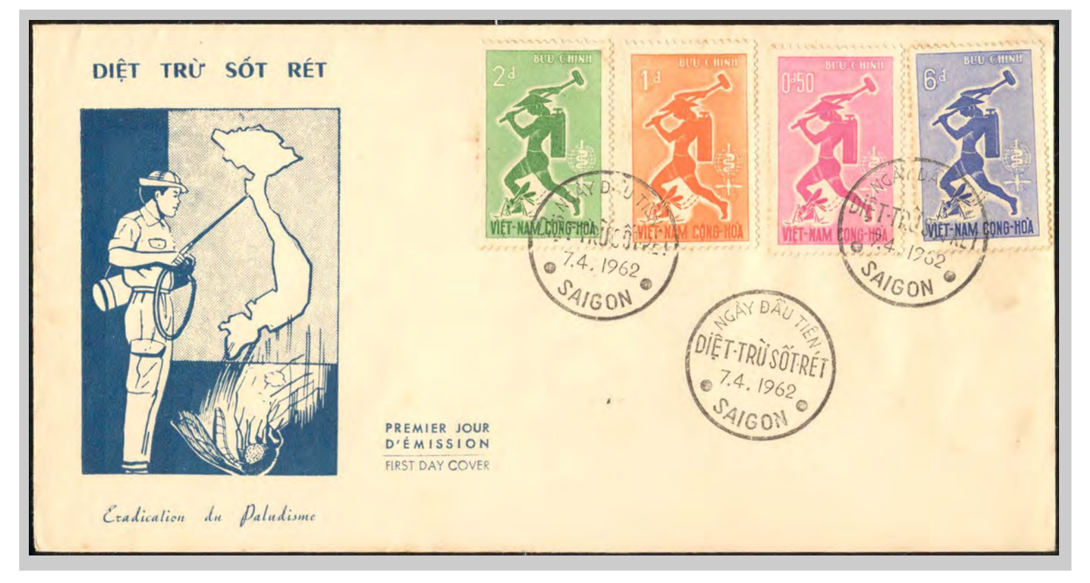
FDC by T.Q.H. (type 4 cancellation)