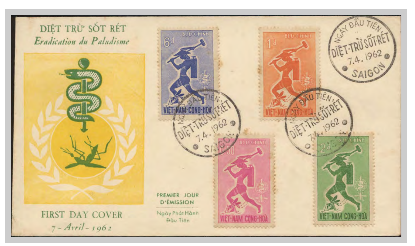
FDC by Mr. NGÔ-NHI-TỜỤNG (type 4 cancellation)