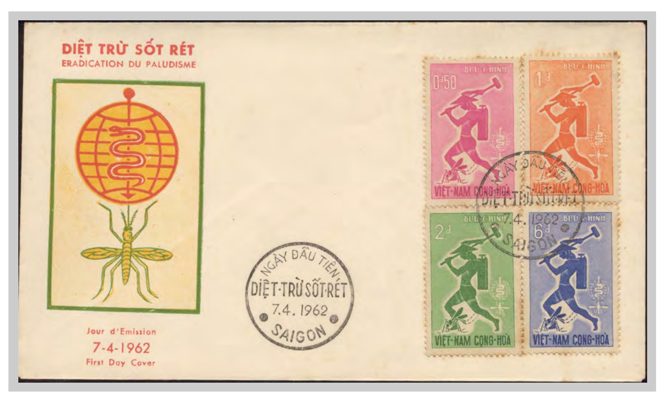
FDC by unknown cachet maker (type 4 cancellation)