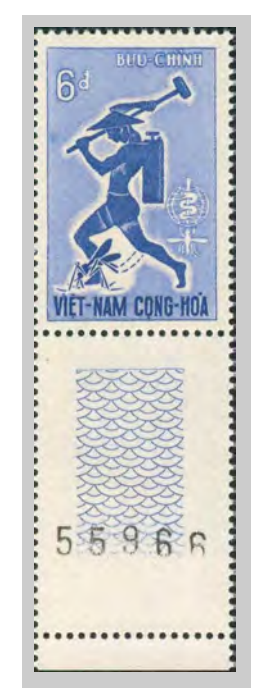
55966 is the sequential sheet number.