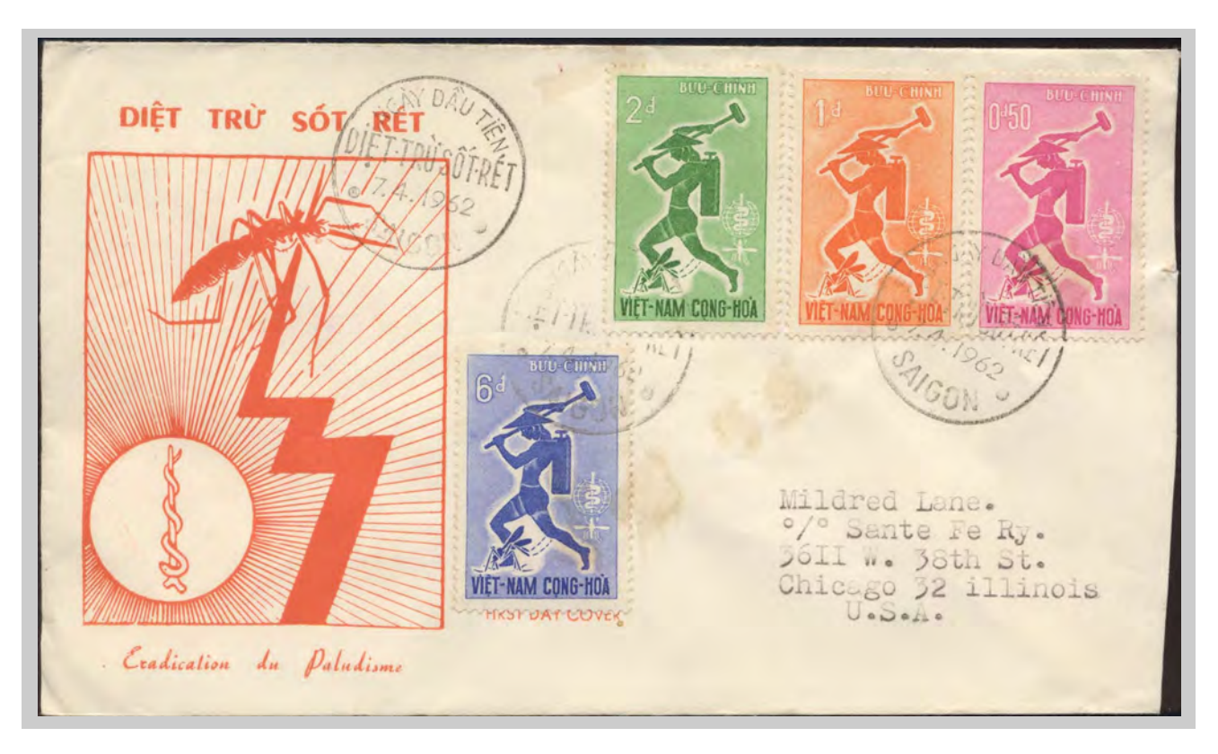
FDC by T.Q.H. with inverted cachet (type 1 cancellation)