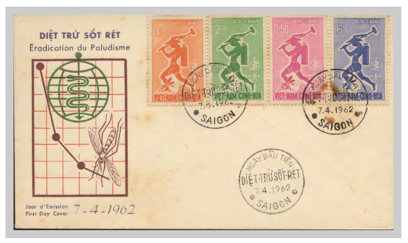
FDC by unknown cachet maker (purple lettering) (type 1 cancellation)