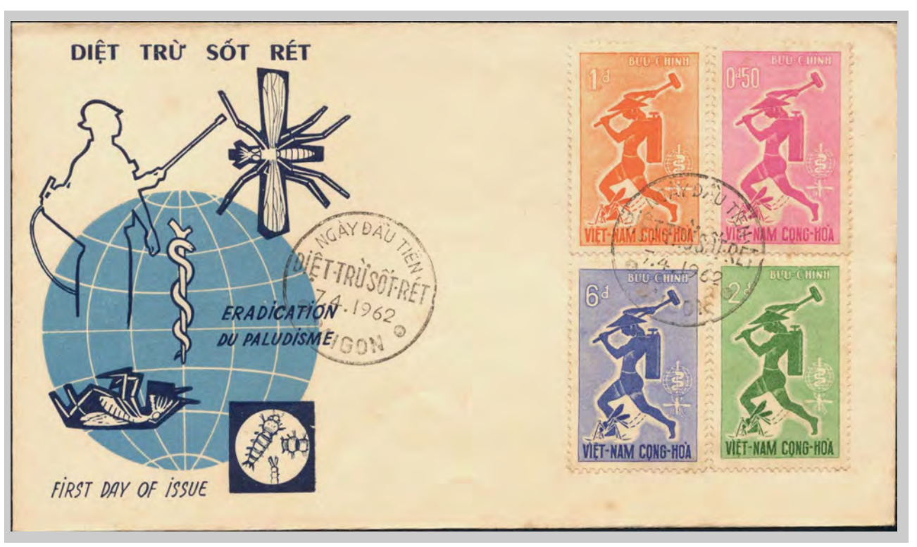
FDC by T.Q.H. (type 1 cancellation)