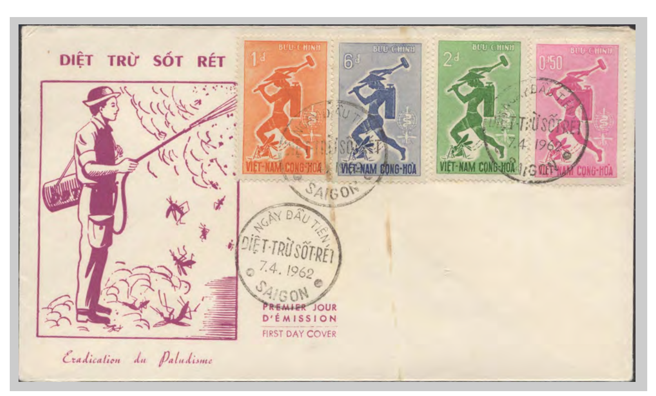
FDC by T.Q.H. (type 4 cancellation)

Reverse of the top FDC at 150%. The color of the initials on the reverse of the FDCs match the color of the cachet