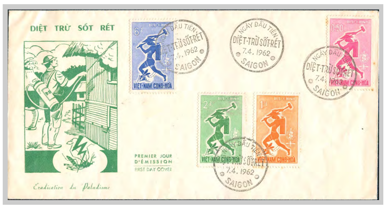
FDC by T.Q.H. (type 4 cancellation)