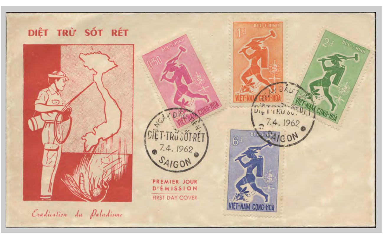
FDC by T.Q.H. (type 4 cancellation)