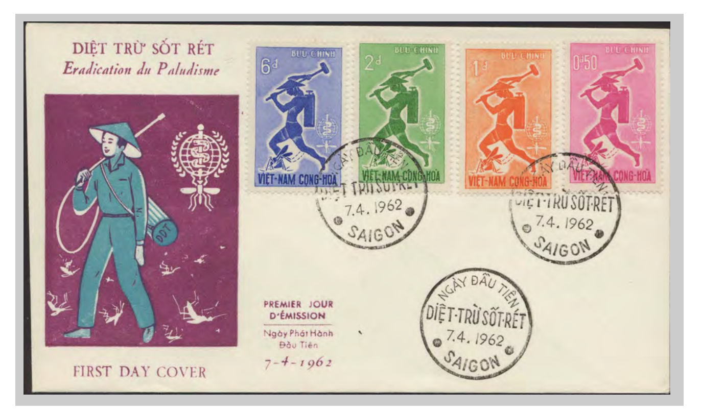
FDC by unknown cachet maker (type 4 cancellation)