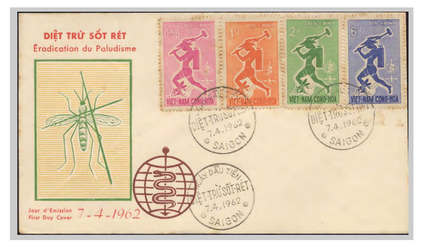
FDC by unknown cachet maker (type 1 cancellation)