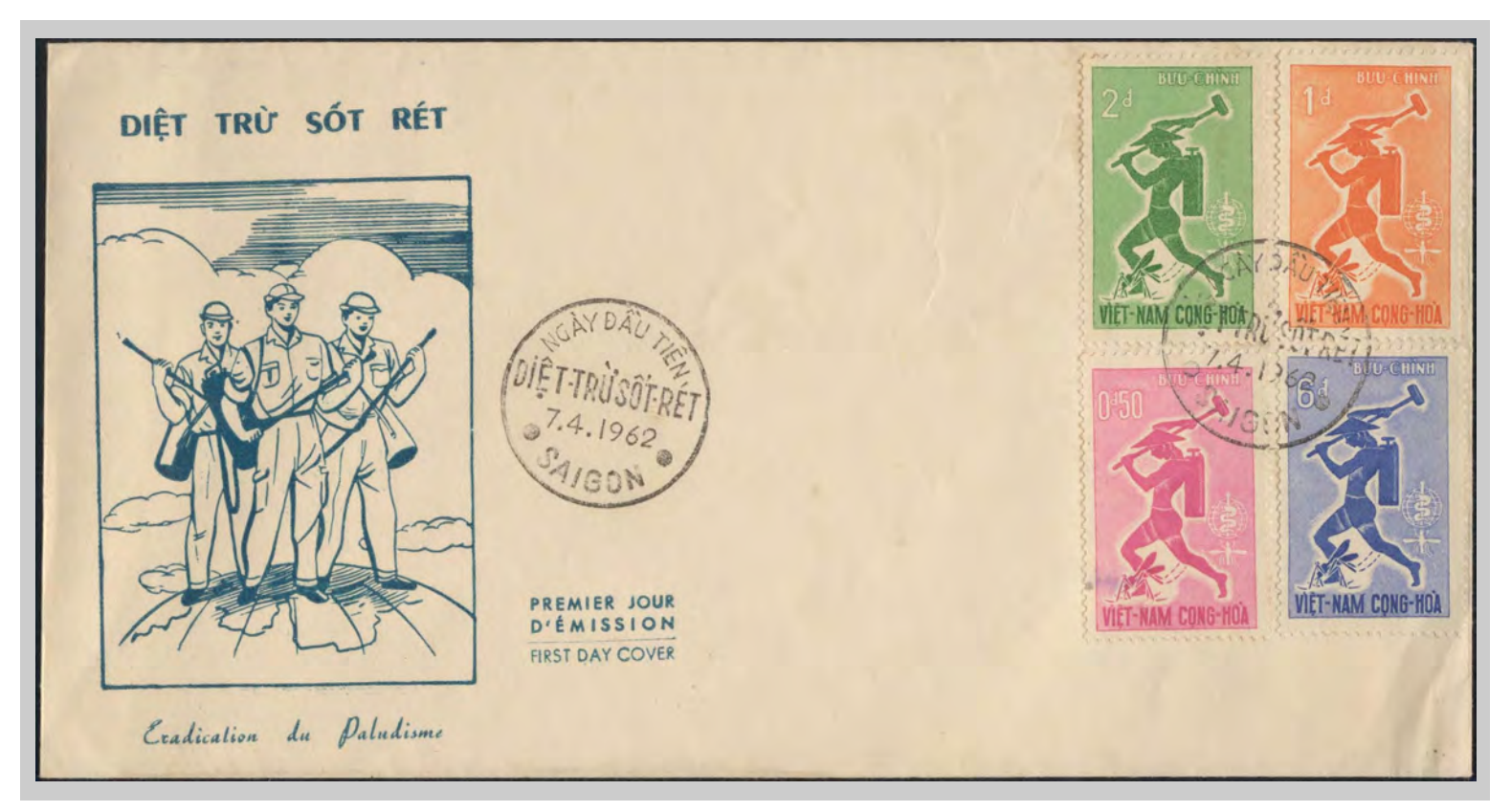
FDC by T.Q.H. (type 1 cancellation)