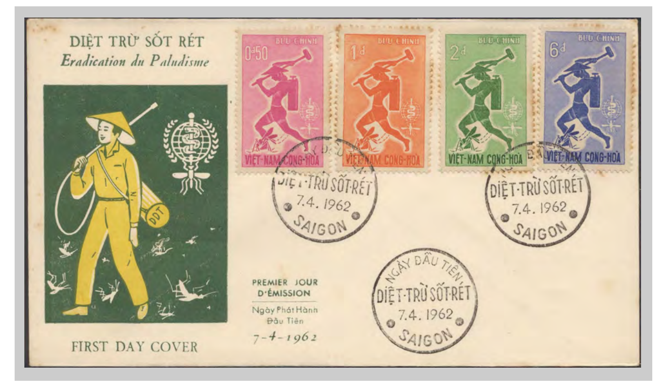
FDC by unknown cachet maker (type 4 cancellation)