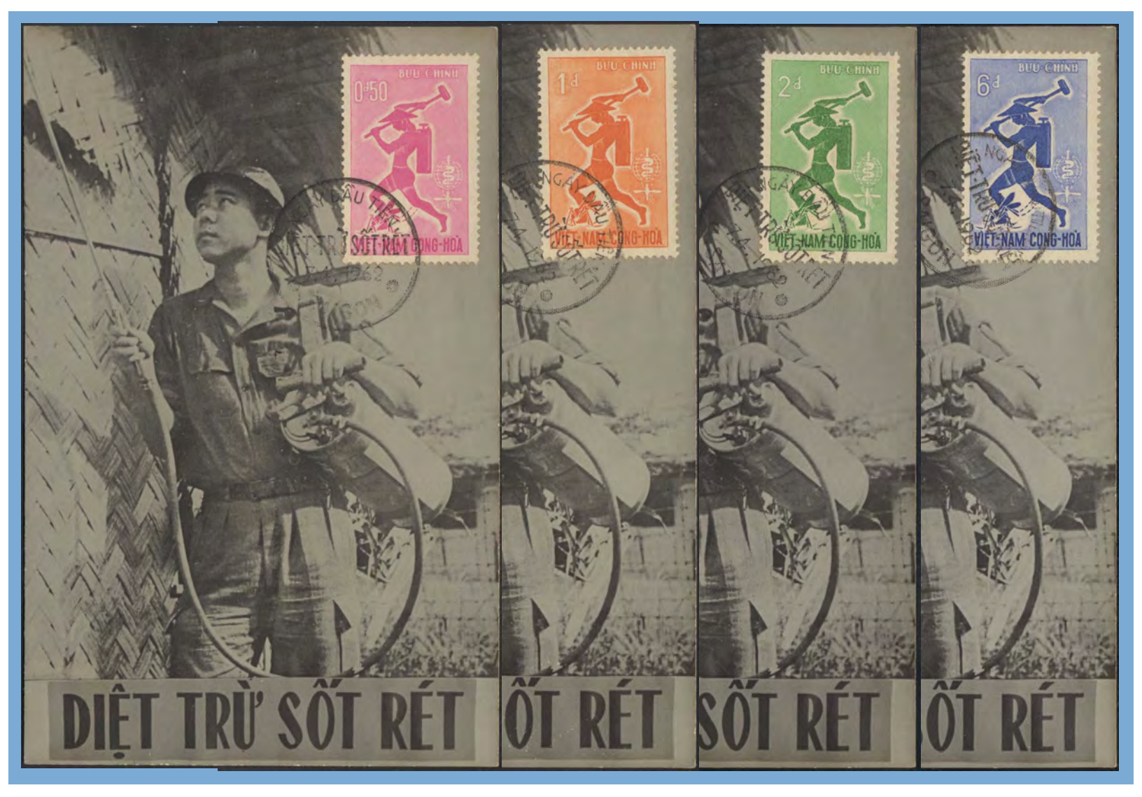
(above) Only recorded set of maximum cards of this card. (type 4 cancellation). Published by Labaphot.