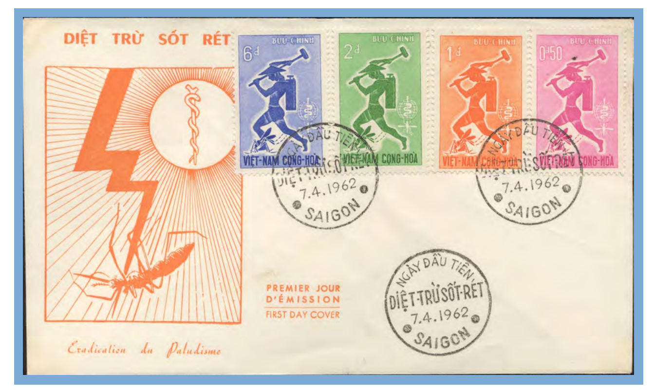
Discovery copy of FDC with the cachet correct, by T.Q.H. (type 1 cancellation)