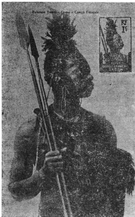
Gabon 1910 1c type Pangown Chieftain

If all these quibbles imply that since maximum-card collecting is not motivated by philatelic considerations it may not be expected to contribute much to philately, we should like to record our agreeable surprise to find a number of maximum cards that served to illuminate some studies we were making on stamp design and production. Questions that often come up when we try to put together the full history of a given stamp are: where did the designer or engraver get his model or idea, and if he used some pre-existing art or model, how faithfully did he copy it or how much did he modify it (in-