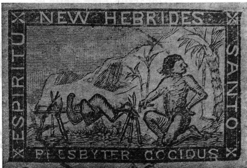
The "roasted missionary" (Presbyter Cocidus) caricature label of New Hebrides—only reported original, in Hals collection (ex-Collas). (Copies have been reprinted from Hals' illustration in a British stamp magazine).

a task of supplicating a beastly ship's captain to carry the mail, and when he did, it was many months before it would be landed at a port with a post office, even to Valparaiso, Chile.