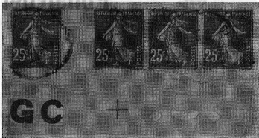
Fig. 2. 25c on GC paper.

The blue 25c was the stamp in use for the longest time, from the 19th of