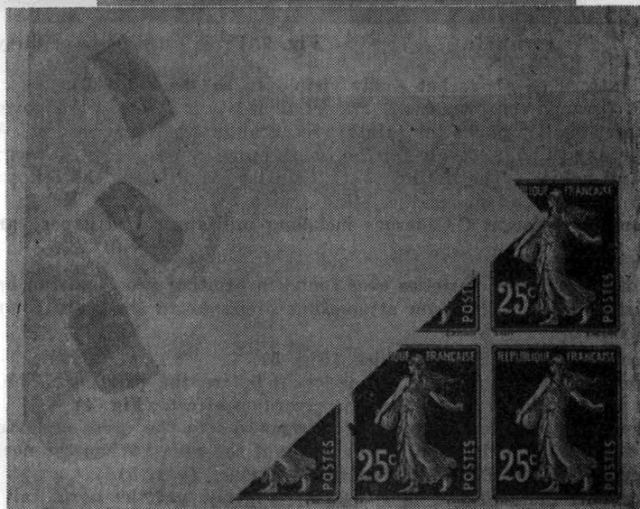
Fig. 8. (a) (Top) Printed on pasted-up paper joint (raccord)—join is at angle to stamp frame. (b) (bottom) Overlap of join turned back to show effect.