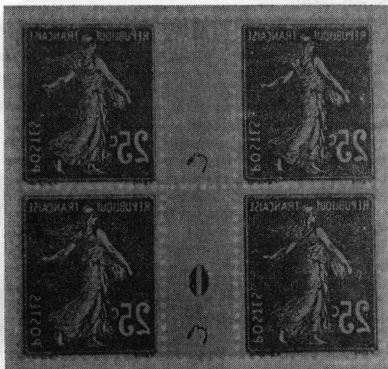
Fig. 5. Printed recto-verso (on gum side, from set-off impression on press bed) (Millesime "O")

tail of the "2" remains on an horizontal plane as in the first two types. (Fig. 1d)