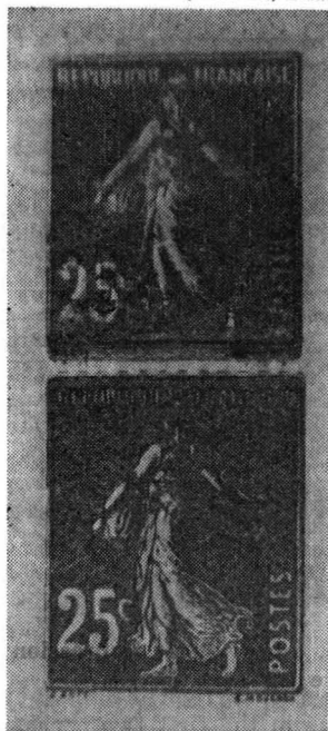
Fig. 3. Defective Inking.

June 1907 to June 1927. It was replaced by the 25c yellow-brown.