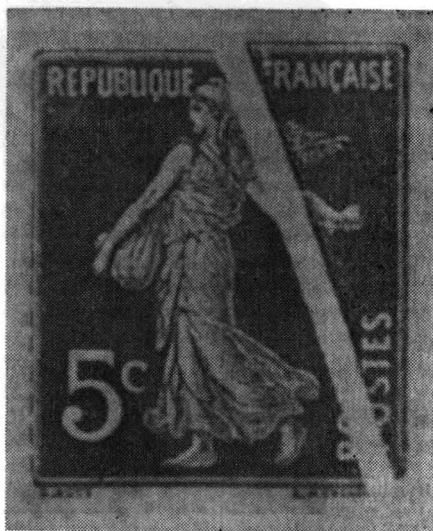
Fig. 4. Printed on an Accordion Fold (opened out)

Type IV by flat plate in sheets of 240 for booklets without pub printed in 1920. The "2" is slightly more than \frac{3}{4} of a mm from the frame. The base of the "2" is thicker than in Type I and better drawn than in Type II. The