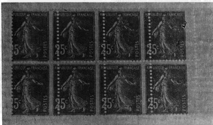
Fig. 6. Misperforation.

D. Paper showing a pattern of lozenges more or less visible when held up to the light (from 1915).