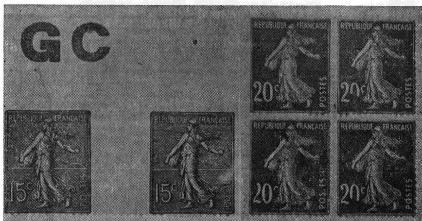
Fig. 7. Imperforate.