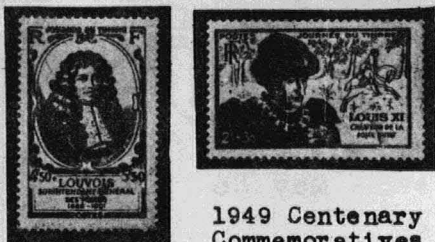
1949 Centenary Commemoratives of France