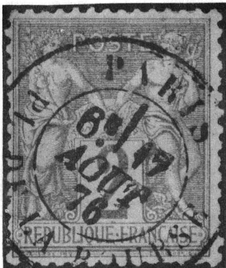
Earlier Date Than Hitherto Known for The 2c Green Type 1 of 1876.